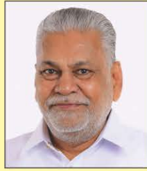
Shri Parshottam Rupala

Hon. Union Minister for Road Transport & Highways, Shipping, Chemical & Fertilizers