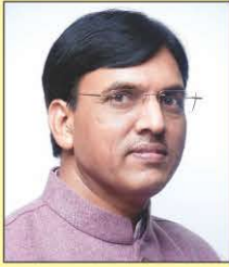
Shri Mansukh Mandaviya

Hon. Union Minister for Road Transport & Highways, Shipping, Chemical & Fertilizers