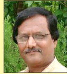
Dr. Shailesh Zala

Hon. Minister of The state Government of India - Agriculture, Farmers welfare & Panchayati Raj